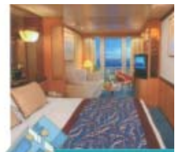
VERANDAH SUITE 284 sq. ft.