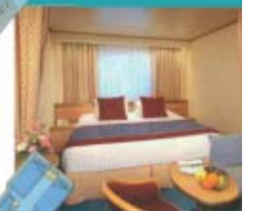
LARGE OUTSIDE STATEROOM -197 sq. ft.